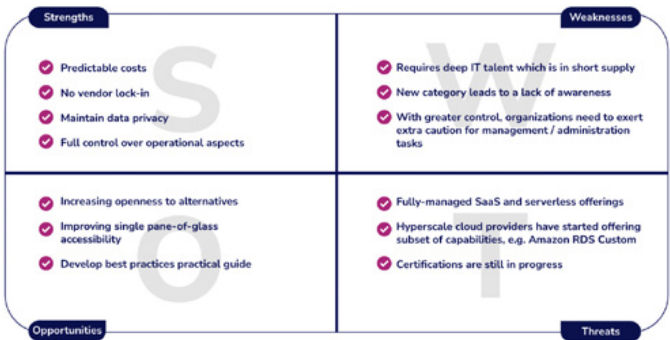
Figure 3. Sovereign DbaaS has compelling strengths that appeal to enterprises that are regulated and have large amounts of sensitive data. Its biggest weakness is that being a relatively new category, there is not enough awareness of its capabilities.

Sovereign DBaaS' time has come. It has the potential to meet strict data privacy compliance guidelines. The main reason one would consider this option is to assert more control over their data stack, which helps meet compliance guidelines, reduce business risks and avoid runaway cloud costs. It leverages key benefits of public DBaaS but without the tradeoffs on the control of its location and ownership. Figure 3 shows a SWOT analysis of Sovereign DBaaS.